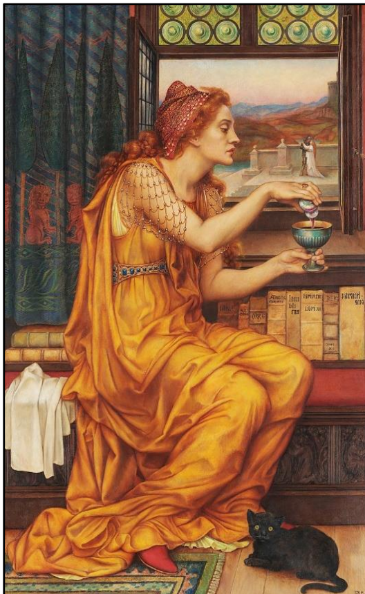
"The Love Potion" By Evelyn De Morgan

It's by Evelyn De Morgan and it shows Sir Tristan with his lover Isolde. That's them through the window in the distance. The story is that King Mark of Cornwall sent Tristan to fetch his bride Isolde over from Ireland, but somehow, they drank a love potion on the way and so tragically fell in love with one another. This painting, then, shows the sorceress mixing a love potion.