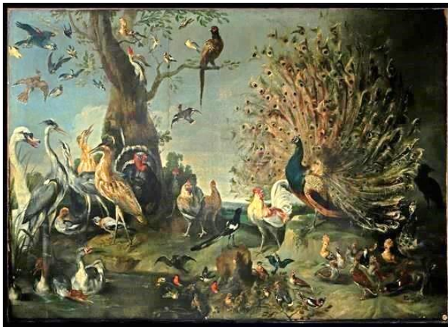
Frans Snyders - "A Concert of Birds by a Pond"

If you go to the café at Lowther Castle you will see this enormous painting on the back wall. After the Second World War the contents of the castle were all put up for sale and only a few items remained in the family hands, including this painting.