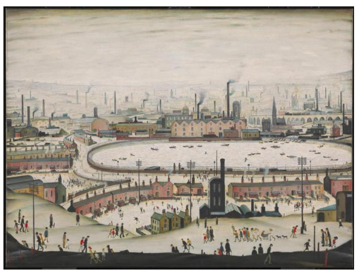
LS Lowry – "The Pond" (1950) The Tate Gallery

https://www.tate.org.uk/art/artworks/lowry-the-pond-n06032