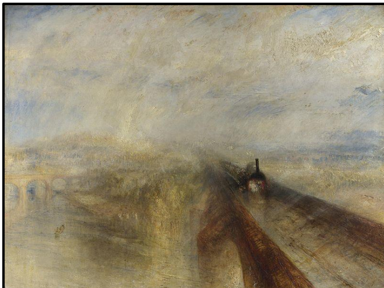
J.M.W. Turner – “Rain, Steam and Speed – The Great Western Railway” (1844) National Gallery, London

September 1 st ! So... a HAPPY NEW (academic and Methodist Church) YEAR to one and all. Another year gone by so quickly? Another New Year and the future lies open in front of us.