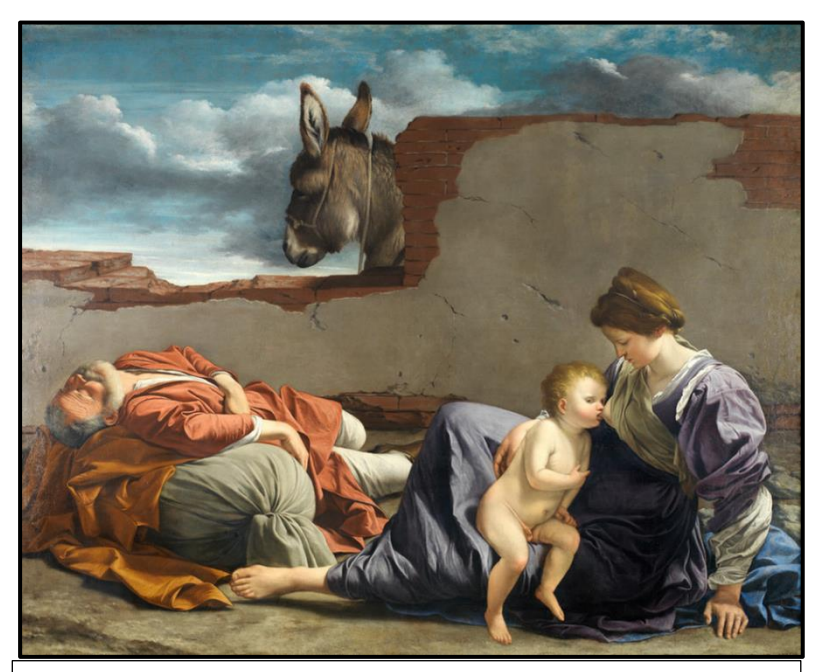
Orazio Gentileschi – "Rest on the Flight into Egypt" (1615 – 20) Birmingham Museum and Art Gallery

In this painting, Gentileschi has treated the subject as if the Holy Family were ordinary Italian peasants. Joseph is old, haggard and exhausted (and rather uncomfortable I reckon, flaked out.) The Virgin is a